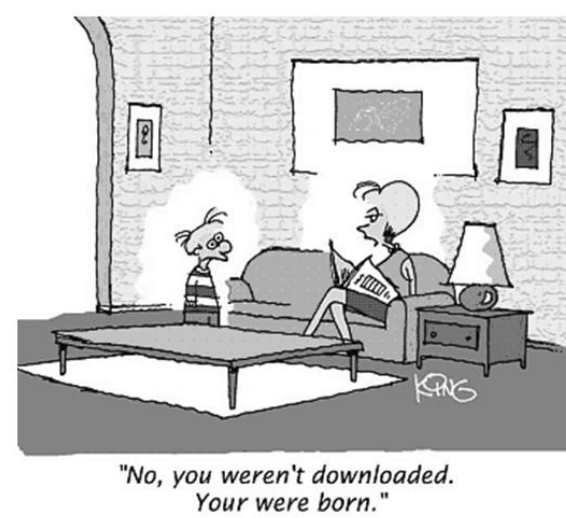
Figura 1. A typical figure

Figure and table captions should be centered if less than one line (Figure 1), otherwise justified and indented by 0.8cm on both margins, as shown in Figure 2. The caption font must be Helvetica, 10 point, boldface, with 6 points of space before and after each caption.